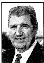
Earl Morrall Dec. 1996