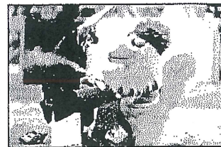
The San Diego Chicken