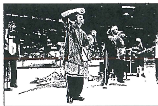
The Baha Men

interested in a whole different set of wins and losses.