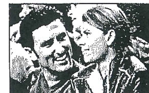
Garciaparra and Hamm

* We realize this one isn't final yet, but hey, it seems like a good idea to us.