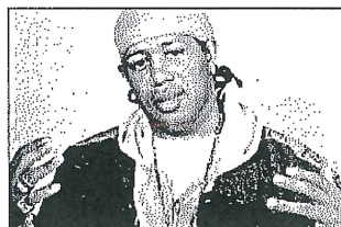
Master P (aka Percy Miller)