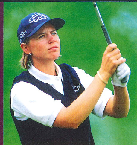
1997 TOURNAMENT CHAMPION ANNIKA SORENSTAM