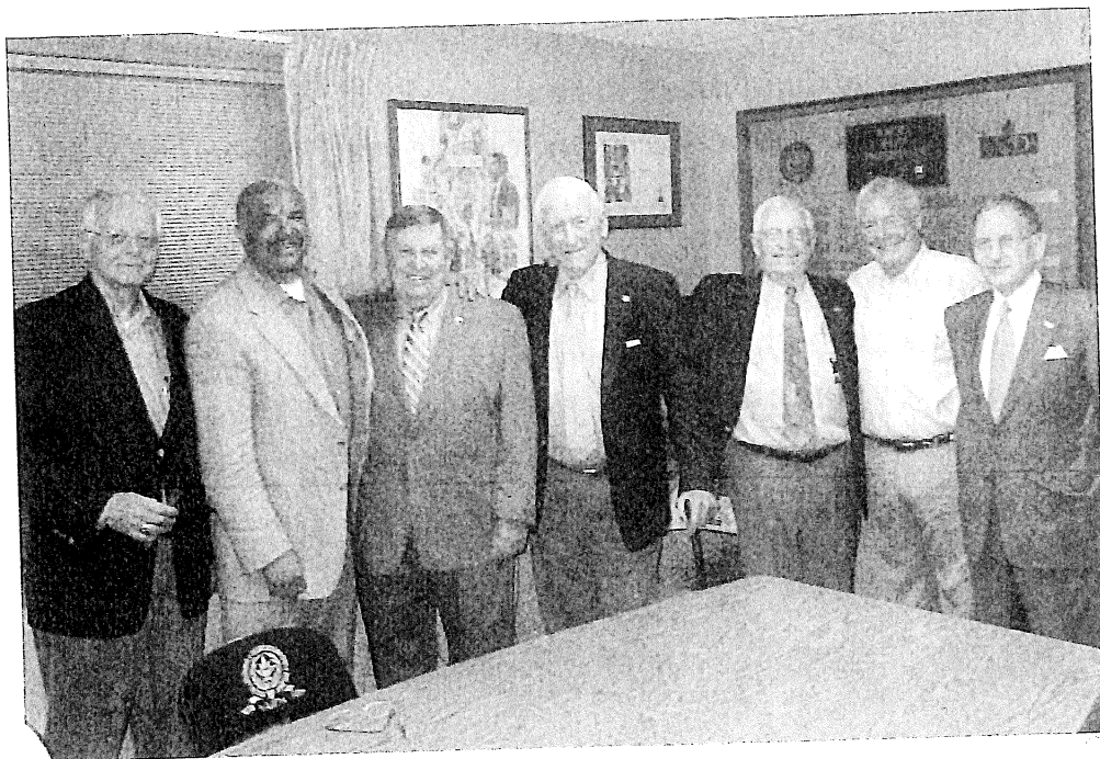
Past, Present, and Future

Positive leaders of the National Association of Directors of Athletics (NACDA)